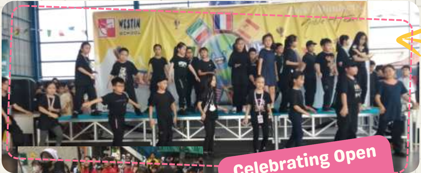
Celebrating Open House