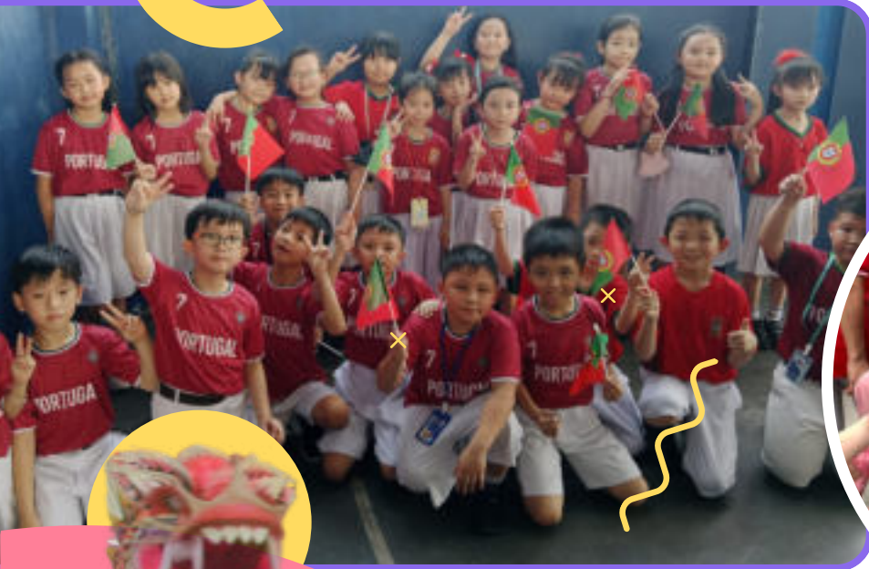
Open House 2024